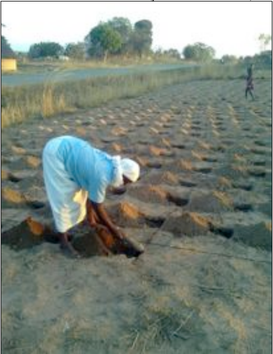
Figure 3 'Have you come to bring me fertilizer?' asked this farmer on arrival of visitors. Fertilizer support is often conditional on farmers' digging of planting basins. Murehwa district, Zimbabwe, November 2010

management standard (for instance, frequent weeding and timely operations); (2) minimum tillage planting basins dug with a hand hoe to concentrate limited water and nutrient resources; (3) fertilizer micro–dosing to achieve higher nutrient efficiency (especially in areas where ICRISAT operated); and (4) improved seed for higher productivity (Twomlow et al 2008b). Notably, mulching (God' blanket), a major element in Oldreive's original CF work, is not stressed in taskforce or ICRISAT publications but is often actively promoted in the field by NGO staff trained by the River of Life Church. Labour–saving technologies such as herbicides and farm implements are not included in these combined food security/CA extension programmes, while input support is often conditional on the use of planting basins (Figure 3). In local vernacular CF is sometimes referred to as 'hondavation agriculture' (kuhonda means 'to slim') or diga–ufe (dig–and–die) (Andersson et al 2011).