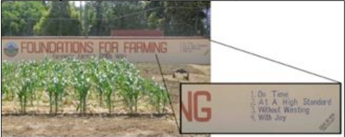
Figure 2 Foundations for Farming (formerly: Farming God's Way) demonstration plot in Harare, 2010