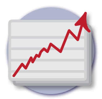
PROMOTING ECONOMIC GROWTH