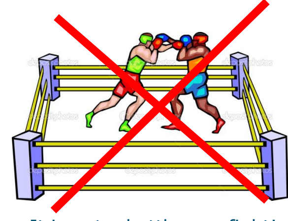
It is not a battle or a fight!