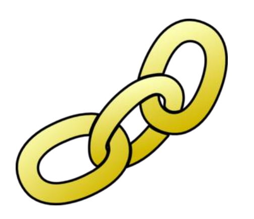
Students connect and help each other