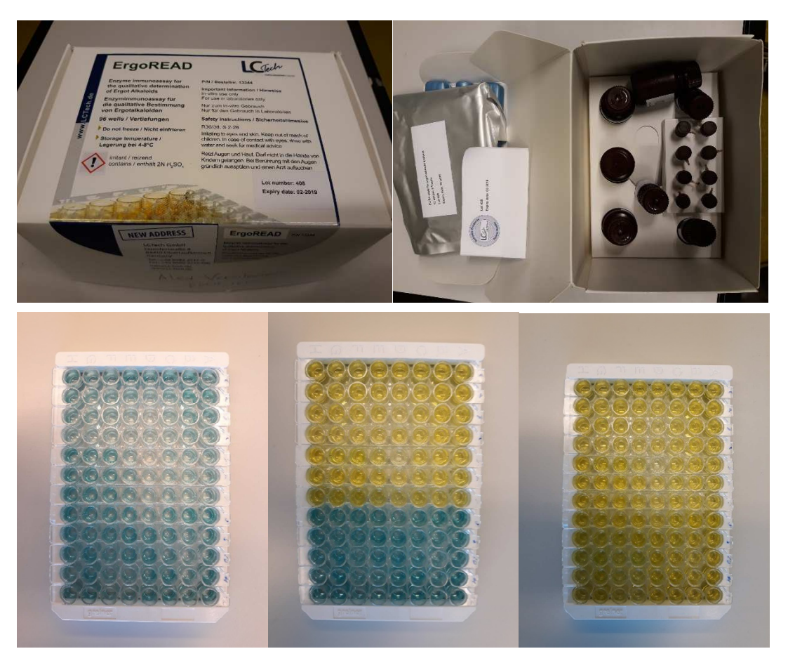
Figure 3. Example pictures of used ELISA kit (test kit 3)