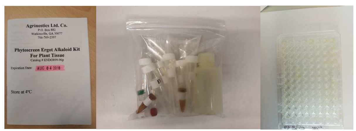
Figure 1. Example pictures of used ELISA kit (test kit 1) Lot No: #END0899-96p Expiration date: Aug 2018