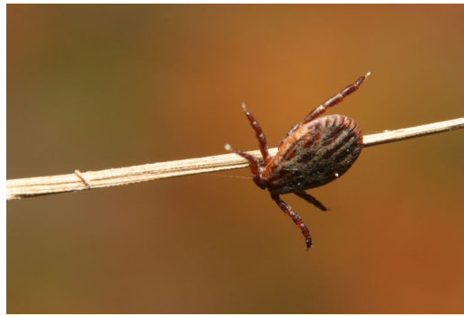
Changing disease vector abundance