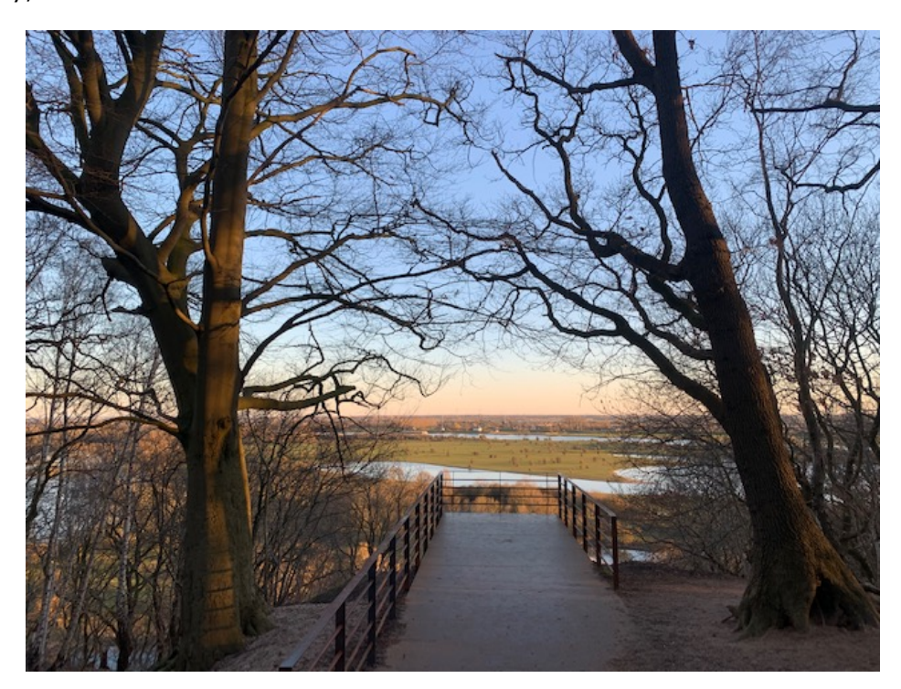
Figure 1: View on the Rhine river from the Grebbeberg, between Wageningen and Rhenen

Please note that this information is sent to all applicants for the Master's degree programme Forest and Nature Conservation at Wageningen University & Research that have the status 'approved' or 'ToBeDecided'.