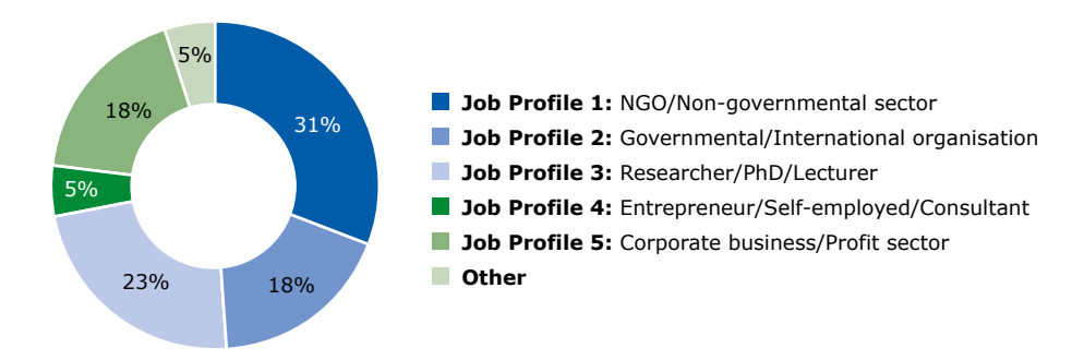
Figure 1 Where our alumni work, based on 657 MID graduates.

These profiles can be used to test your interests for future jobs and hopefully inspire you about the multitude of possibilities upon graduation.