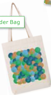
Cotton Shoulder Bag