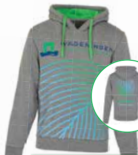
Hooded Sweater Grey