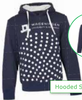
Hooded Sweater Blue