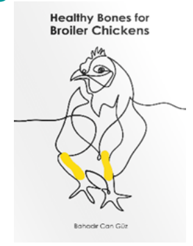
Bahadir Can Guz

Adaptation Physiology (ADP) Date: 5 January 2022 Time: 13:30