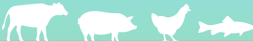
IMAGEN & Breed4Food Individual Tracking symposium

The IMAGEN and Breed4Food Individual Tracking projects together organise a symposium on automated phenotyping .