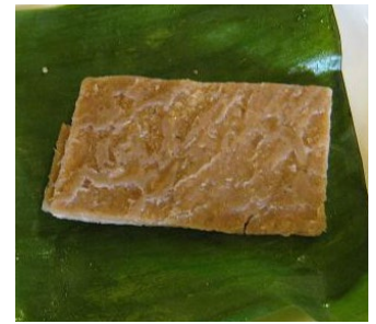
Figure 2: Kocho as a ball of fermented dough and flatbread.