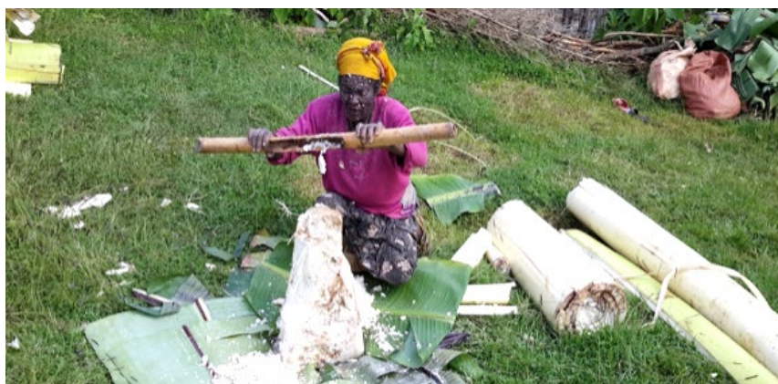
Figure 5: Woman in Sidama region busy crushing the Enset corm.

The informal marketing is highly dominated by men”