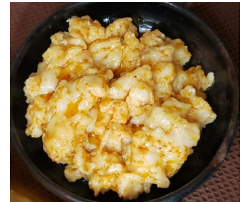
Figure 3: Bulla in powder form and as porridge.