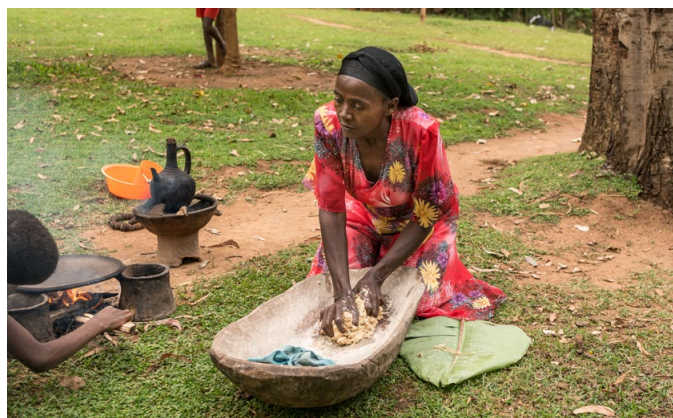
Figure 6: Making of Enset bread: Kocho in a village in Southern Ethiopia.

A deliberate strategy is needed to address gender inequality in the value chains for Enset products”