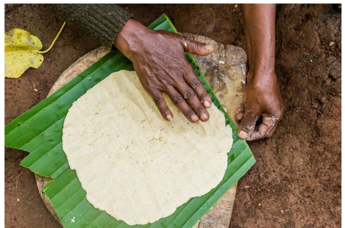
Figure 4: Preparation of Enset flatbread: Kocho.

A closer look into the informal economy dimension in the Enset value chain can contribute to a more realistic image of the ‘wonders’ of Enset in the food system.