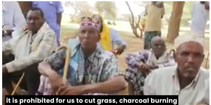
Figure 10: Stills from the speech of a Dhahar clan leader.