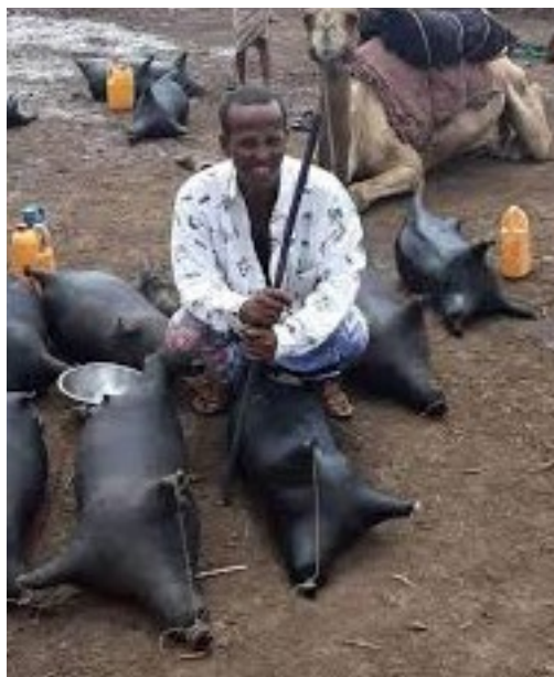
Figure 5: 'Qarbad', traditional container made of animal hide or skin, used to store milk, water or butter.

The very high Hajj season volumes indicate increasingly seasonal livestock trade. Musa, Wasonga and Mtimet observed that due to Saudi and Somaliland Government policies there are monopolistic exporters/ quarantine station investors in the markets, who have the power to impose prices in the market. Low prices induce the sale of young animals.