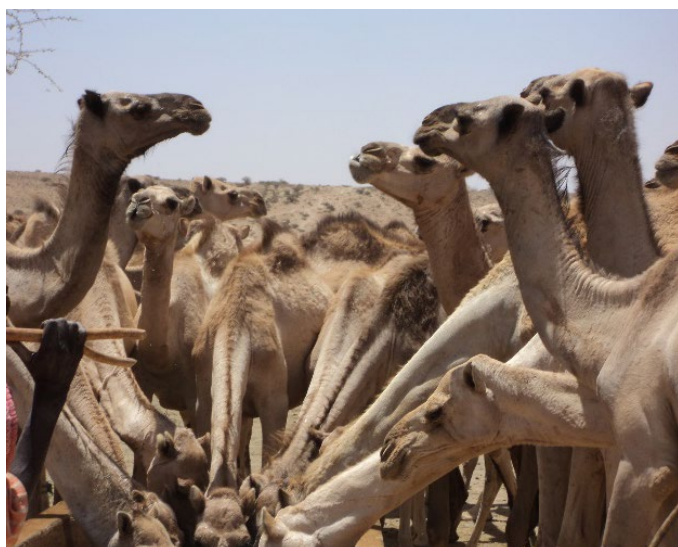
Figure 1: Camel drinking water from animal troughs.

Agro-pastoralists, and especially pastoralists, keep relatively large numbers of animals in part, so that they are prepared for drought and other calamities. The size of herds can strongly fluctuate over the years. Goats and sheep are very important for rapid recovery from losses. Camels and indigenous breeds of cattle, goats and sheep are well-adapted to prevailing conditions (Muigai, 2016). Camel lending mechanisms are important for camel herd restoration; this practice has existed for centuries. Camel leasing (through camel dairies) is a new modality tested in Somaliland (RTI international, 2020, and 2021, Nori, 2010)