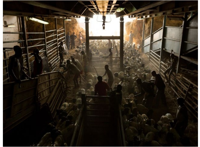
Figure 8: Animals herded in ship in Berbera.