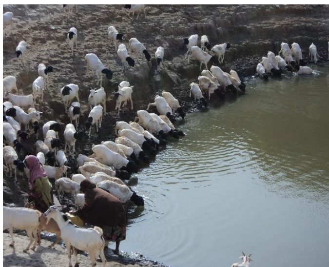
Figure 2: Sheep and goats drinking water from the open source of shallow well.