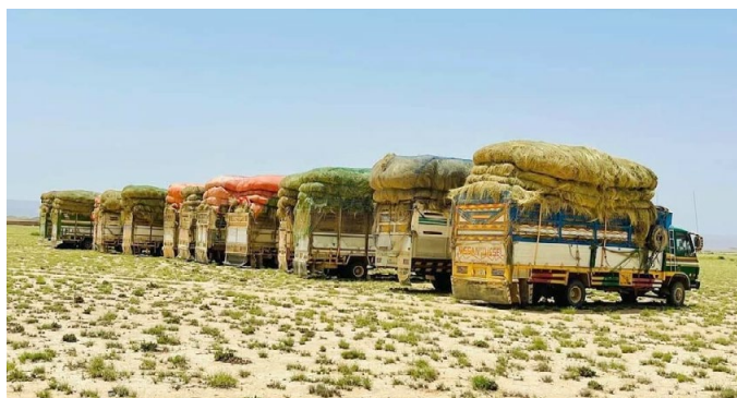
Figure 11: Lorries with grass set on fire in Dhahar district (Eastern Sanaag).

The speech is recorded and broadcasted to inform everybody that illegal acts will be heavily sanctioned, because our land cannot be used as a route to transport charcoal and grass; "We will destroy it by burning. We don't want you to use our lands; avoid us."