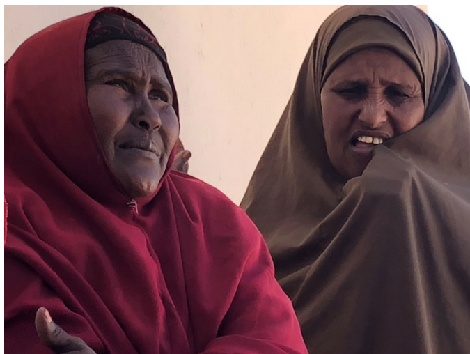
Figure 3: Women in agropastoral community, Caynabo.

As in many African countries, informal saving and credit groups ( hagbads ) are common in Somalia, especially among women. A hagbad is comprised of people who know and trust each other and come together to save small amounts of money at regular intervals (per week, per month). The money saved is pooled and handed over to one group member, who can then invest it into an entrepreneurial activity. The next round, it is the turn of another group member. When each group member has received a payment, the group starts the process-cycle again.