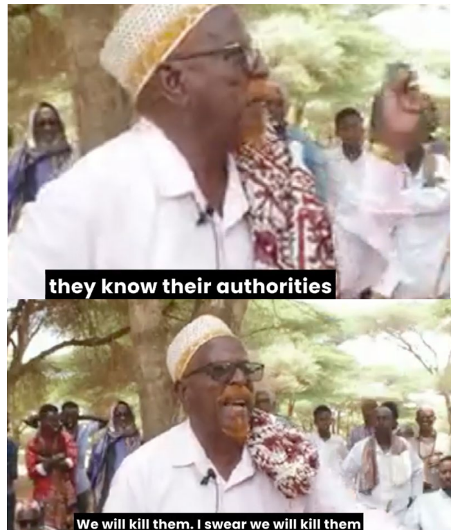
Figure 9: Stills from the speech of a Dhahar clan leader.

We demand the respected Ministry if the Government authorizes for taxation, if the Ministry of Environment is