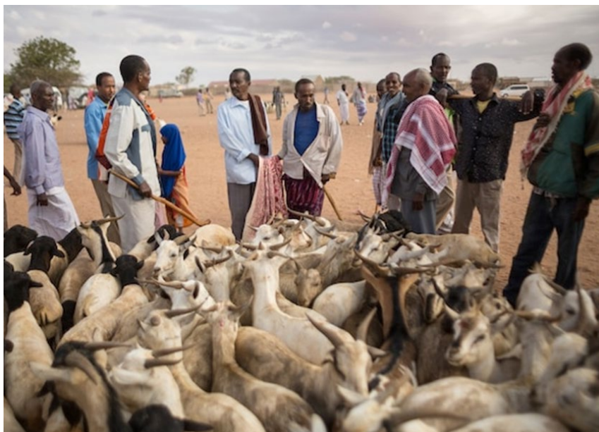
Figure 6: Sheep and goats are brought from around the region to the Burao Livestock Market. Traders use a system of holding fingers to indicate the price they are willing to accept. Negotiations are made in secret under a scarf.

The exporters are linked to Somaliland animal traders, who ensure the cattle movement from the production zones to Burao (first transit station) and from there onwards to Berbera. Market prices for small ruminants in the large Burao livestock market depend on quality and especially on seasonality (e.g. Hajj demand).