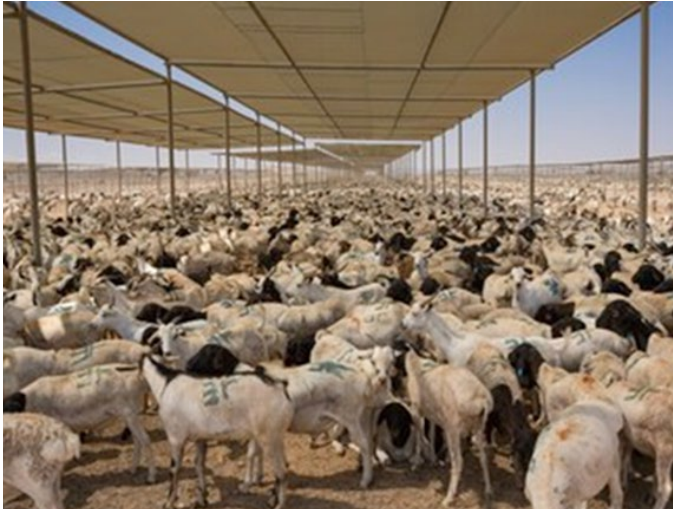
Figure 7: Quarantine centre in Berbera, the main seaport in Somaliland.