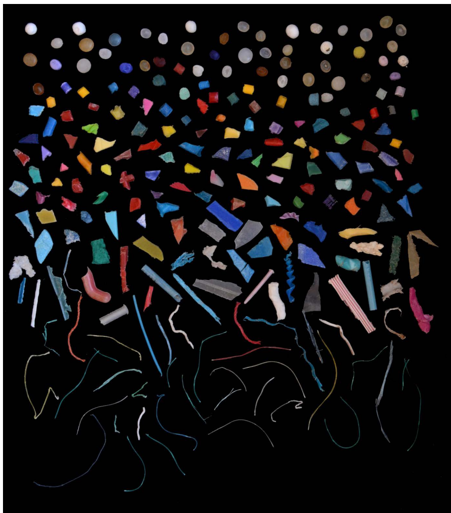
The diversity of microplastic particles

WIMEK researchers have produced ground-breaking and WoS highly cited research especially on the detection, fate and effects of microplastic in aquatic and terrestrial systems. They were the first to develop biomonitoring methods using fulmars, to provide experimental and assessment models to assess the role of plastic-associated chemicals in risk of microplastic 3 , effect and risk assessment methods for the particles themselves, quantitative quality assurance and - control (QA/QC) assessment methods for analysis and effect tests 4 , single species bioassay methods for micro- and nanoplastic including use of metal-doped particles, long term community effect test approaches, microplastic food web accumulation and lake food web effect models, river transport models and global multi-pollutant models. 6 WIMEK researchers invented theoretical approaches to capture the diversity as present in the plastic size, shape and polymer continuum via probability density distribution functions enabling breakthroughs in data processing, probabilistic fate, effect and risk modeling and assessment. With this, WUR, via WIMEK, ranks second in terms of plastic debris research output (after Plymouth University, UK) and WIMEK's top scientists rank highest among plastic researchers on the 2018, 2019 and 2020 Clarivate lists of high cited researchers.