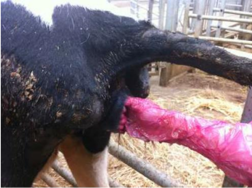
Figure 5: Rectal examination of cow.