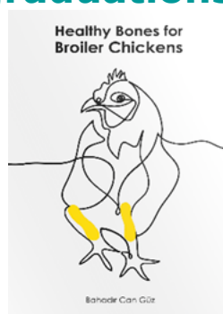
Bahadır Can Guz