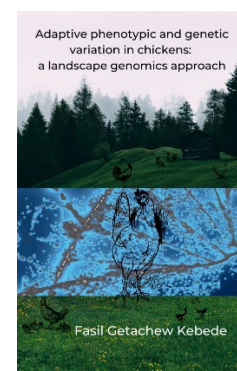
Fasil Getachew Kebede