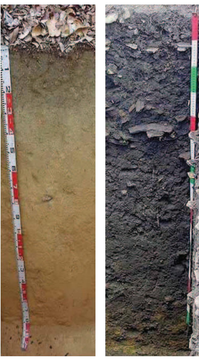
Regular tropical soil