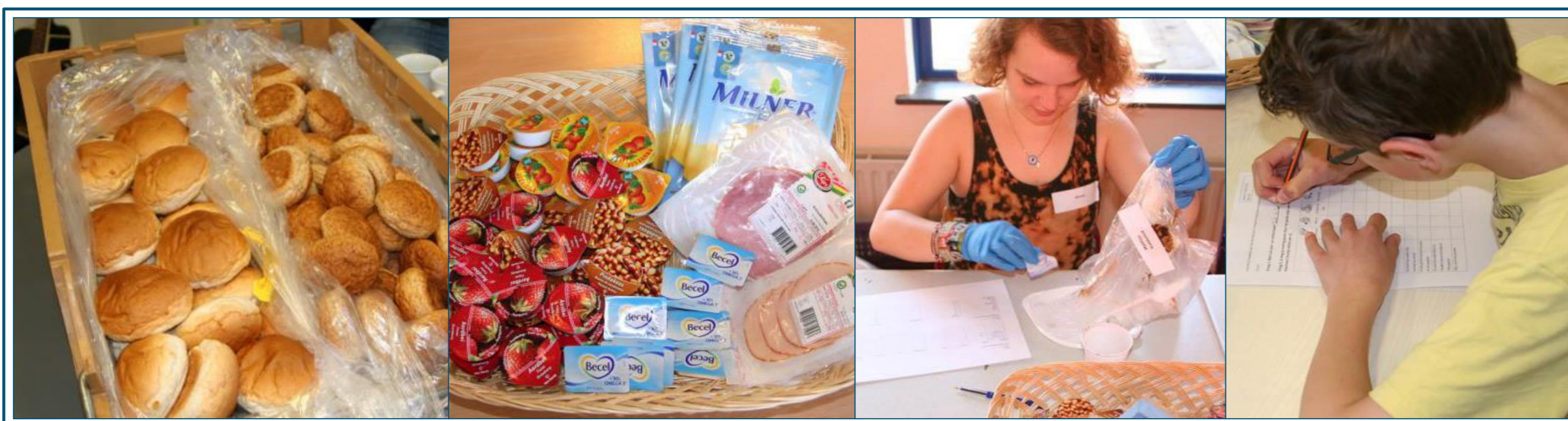
Figure 2. Pictures of the study: bread rolls; toppings; analysing left overs; questionnaire