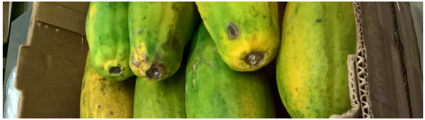
Anti-fungal treatments reduce mould development in Papayas

Packaging papayas prior to transport, and heat treatment upon arrival at the wholesaler, reduces post-harvest fungal infection. Heat treatment prior to transport seems likely to be even more effective against fungal infection. This is the outcome of studies by Wageningen Food & Biobased Research, conducted under the umbrella of the GreenCHAINge program. The work supports the fresh fruit industry in increasing the quality of papayas on the shelves of European stores.