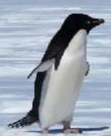
Adelie penguin Pygoscelis adeliae