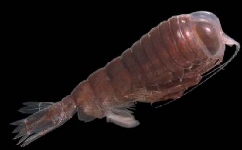
Amphipod Hyperia macrocephala