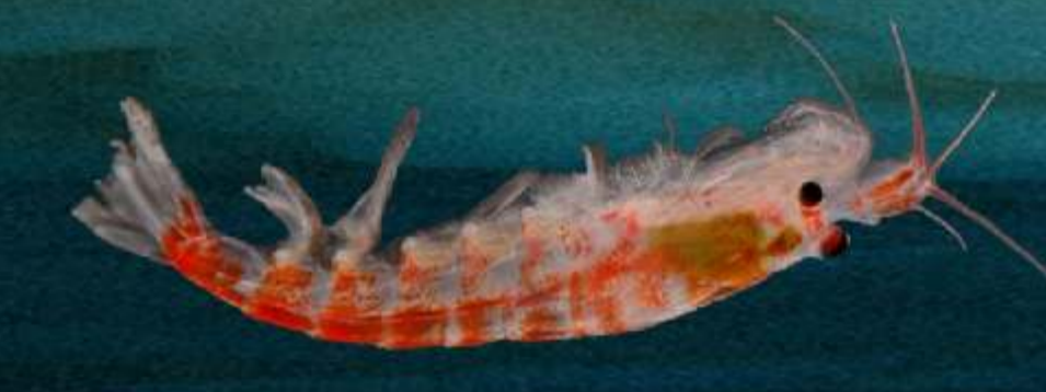
Antarctic Krill Euphausia superba