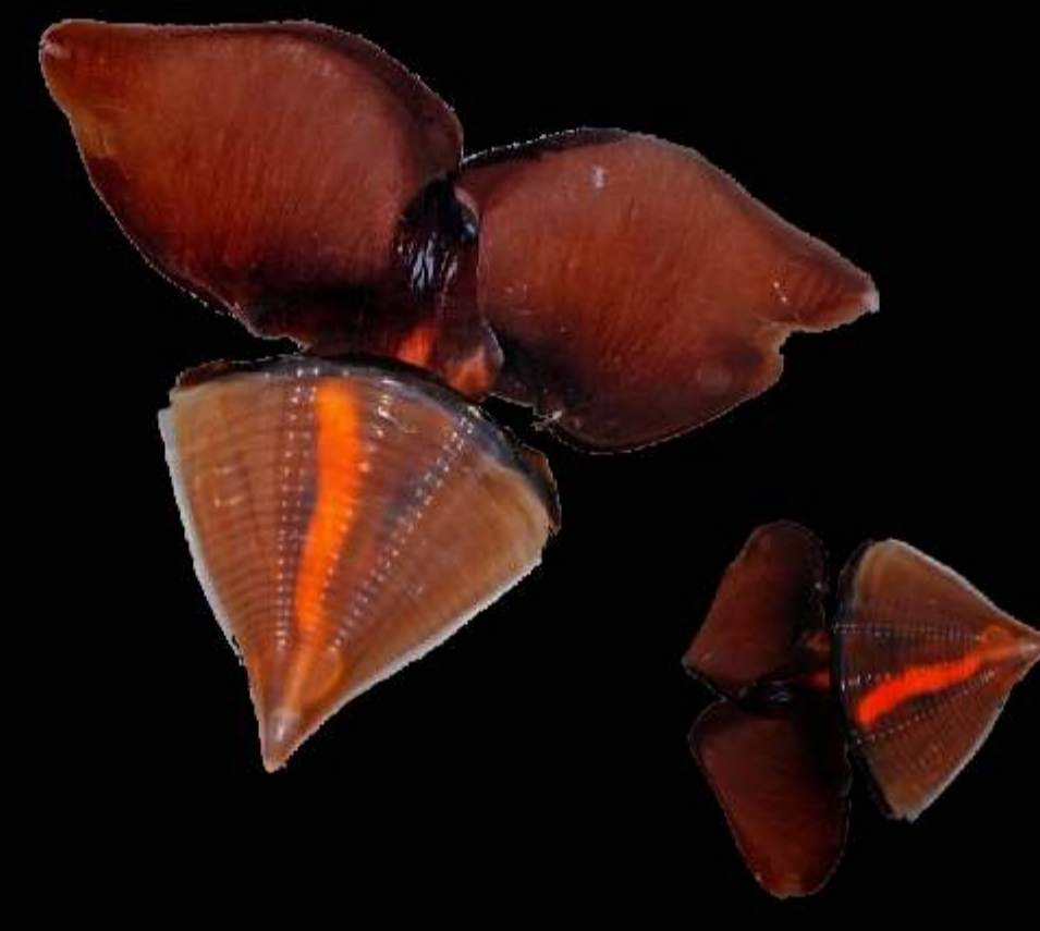
Pteropod Clione platkowskii