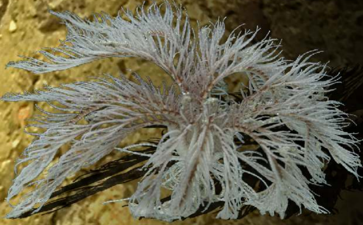
Feather star Promachorinus kerguelensis