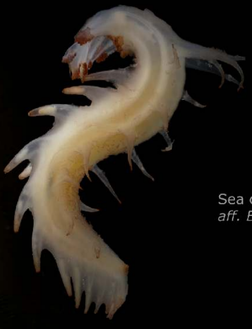
Sea cucumber aff. Bathyploetes sp.