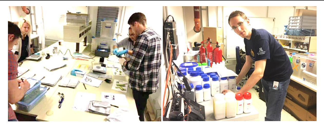
Figure 11: Sample Preparation for food safety tests (left). Preparation of nutrients and other dangerous goods to be taken to Antarctica (right).