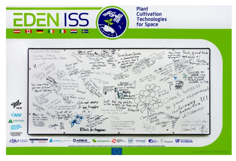
Figure 1: The MTF window cover, with the logos of all the partner companies, and signatures. NOTE: This is a collage, meaning the logos were put in the picture afterwards!