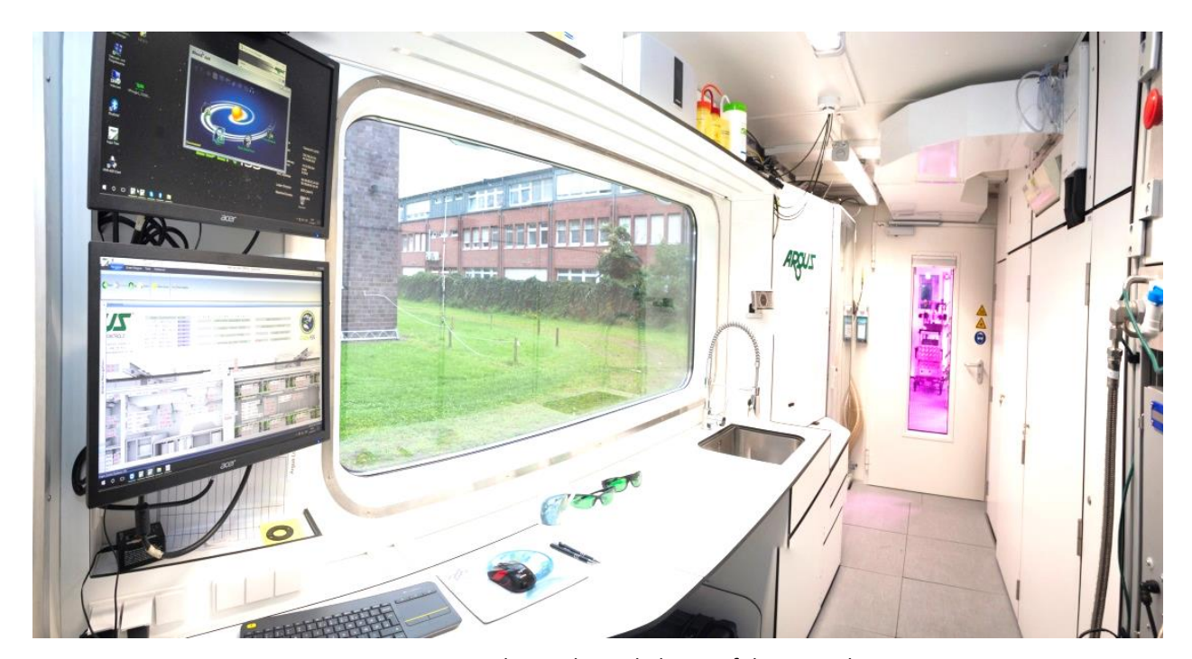
Figure 7: Service Section during the end phases of the ground tests