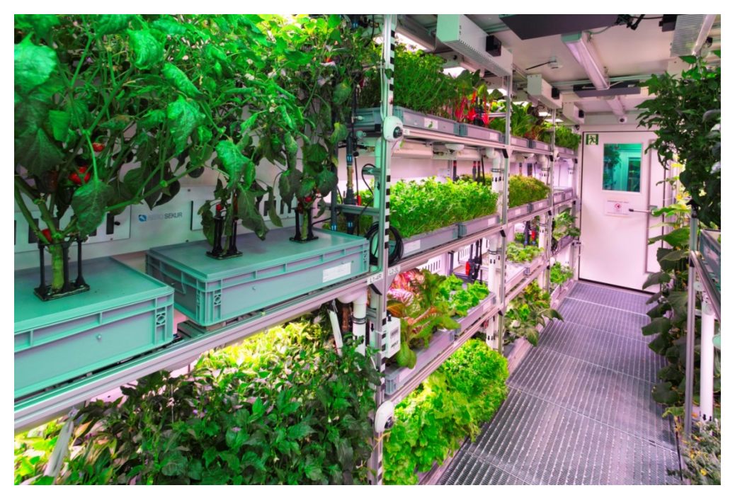
Figure 8: FEG plants in full bloom, right before a harvest cycle