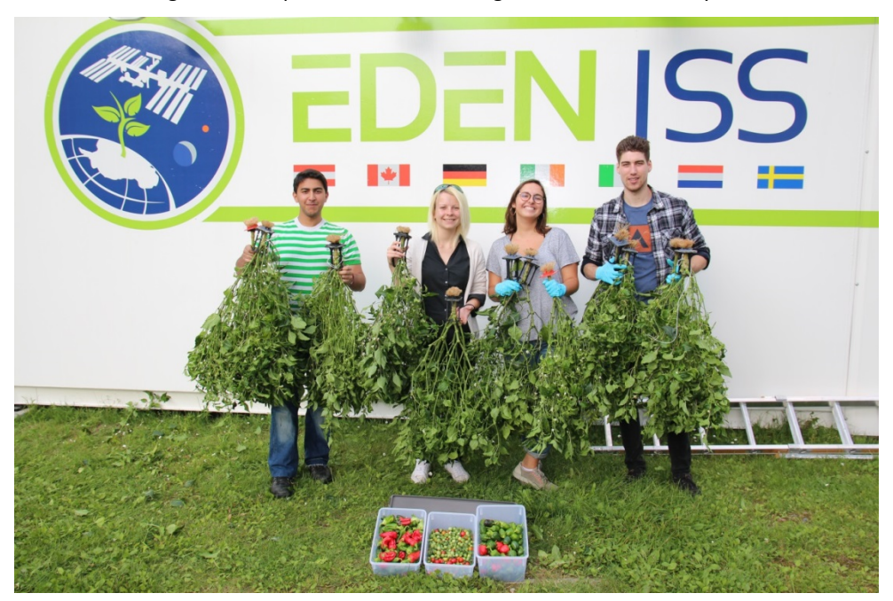
Figure 9: Final harvests during ground tests, used for sampling and analysis of safety for consumption