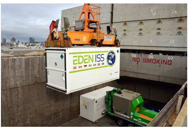
Figure 16: Loading of one of the EDEN ISS container onto the Golden Karoo in Hamburg