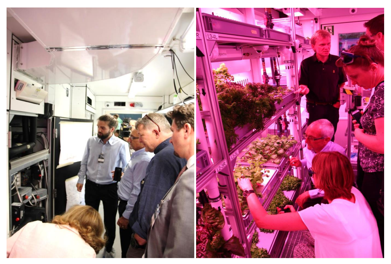
Figure 5: EDEN ISS team members explaining to FRR board members the AMS (left) and the FEG (right)