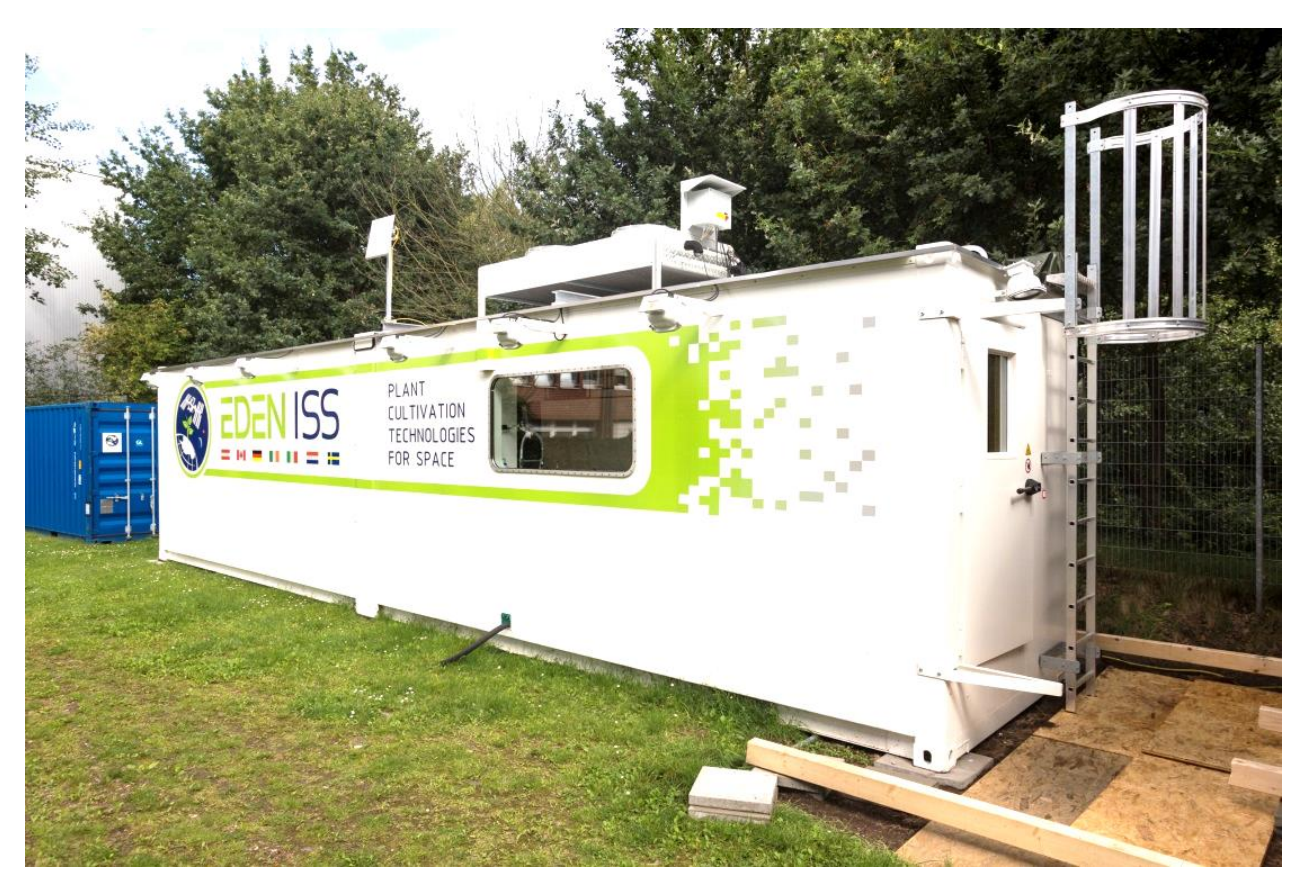
Figure 6: The EDEN ISS MTF nearing the end of the AIT phase

ments), measurement of condensate production, as well as laboratory confirmation of food safety of several of the harvested crops. The AIT phase also permitted a wide range of outreach activities to be conducted on-site at DLR (e.g. official press conference, high-level visits of NASA and others).