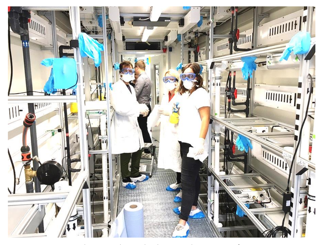
Figure 12: Cleaning, sterilizing and packing FEG and Service Section for transport