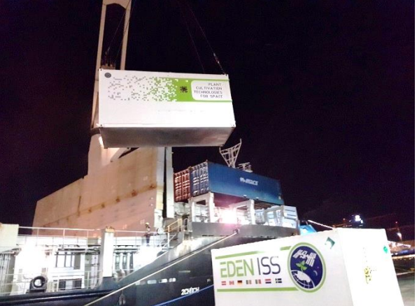
Figure 17: Unloading of one of the EDEN ISS container in Cape Town date: ~6<sup>th</sup> of November 2017