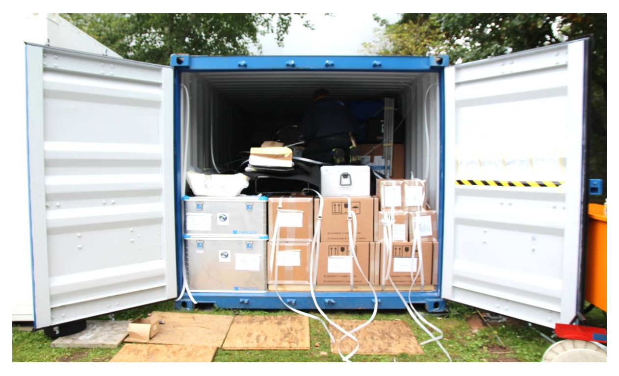
Figure 14: The EDEN ISS blue transport container as packing continued