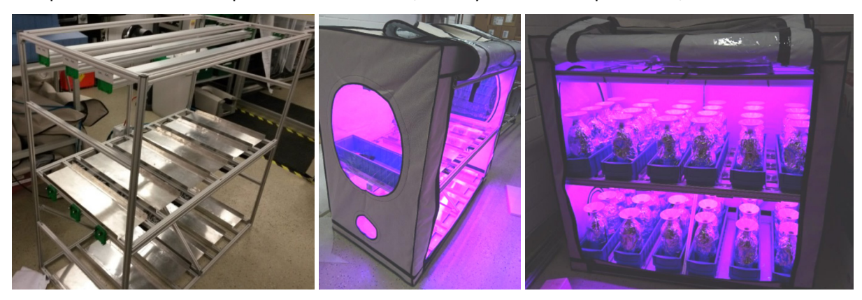
Figure 18: Salad box.

The Salad Box has a 2-shelf structure, in which 48 bottles can be kept, each bottle capable of growing one plant. The bottles are placed in rows of four, on trays that can be pulled out, for ease of access.