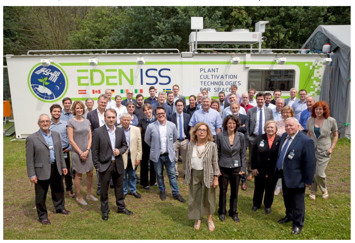
Figure 2: FRR participants

This productive meeting followed up on the Critical Design Review in 2016 and the Concurrent Engineering Meeting in 2015. We now look to implement the most scientifically evolved strategy the mission has had, derived from recommendations via the Scientific Advisory Board.