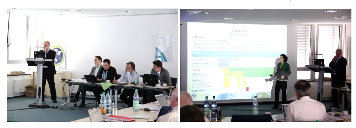
Figure 4: Presentations given in the FRR