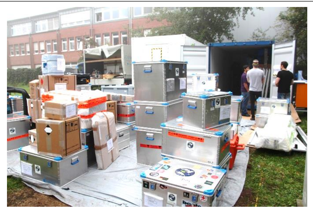
Figure 13: Project hardware during the packing of the EDEN ISS containers