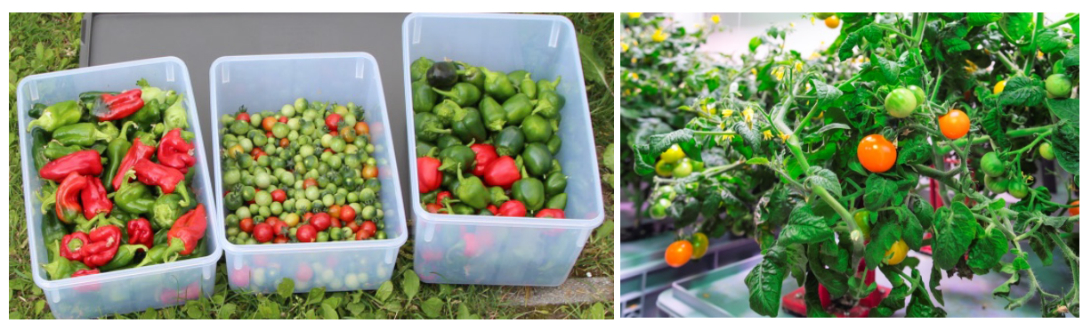
Figure 10: Final ground test harvests (left). Tomato plants in growth phase, with some ripe fruits (right)