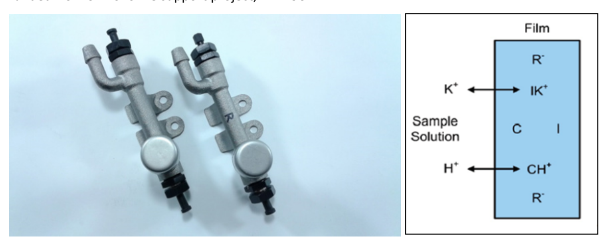
Figure 19: Current optrode housing (3D sinter-printed titanium) (left), Membrane exchange of potassium (representative) (right)

The calcium optrodes were trialed during the EDEN ISS AIT phase in Bremen. The optrode calculated hydroponic solution calcium concentrations were compared with HPLC results and allowed the team to garner several lessons learned and make several enhancements to the optrode system prior to shipment to Antarctica. The team has also been in contact with CleanGrow and acquired an updated six-ion ion selective electrode that will be employed on an opportunistic basis in Antarctica. The collaboration with CleanGrow also provides benefit due to CleanGrow's involvement with the other EC funded Horizon 2020 life support project, TIMESCALE.