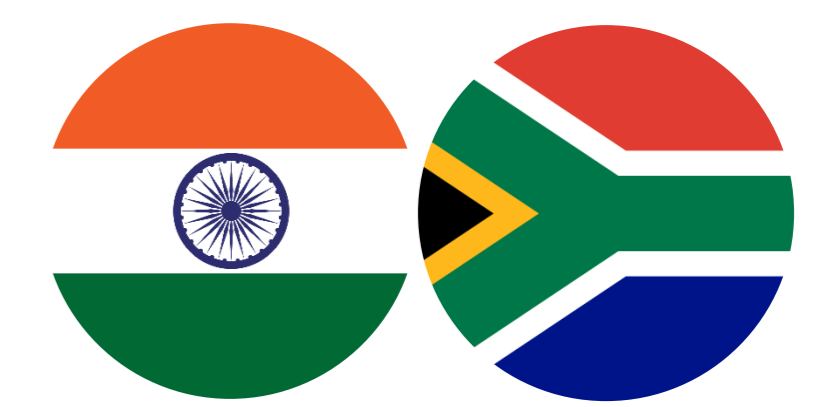
Hotspot countries: India & South Africa.