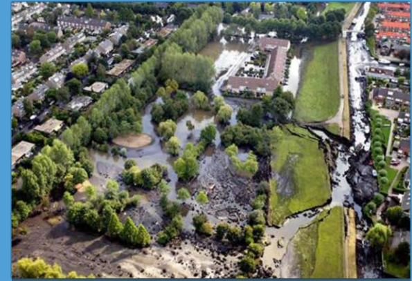
Dike breakthrough Wilnis Netherlands, 2003

4. Put the outcome of 2-3 on the SOPHIE website, and in a review paper, with version number, date, signatures of representatives that underline the choices, bottle necks, and improvement proposals.