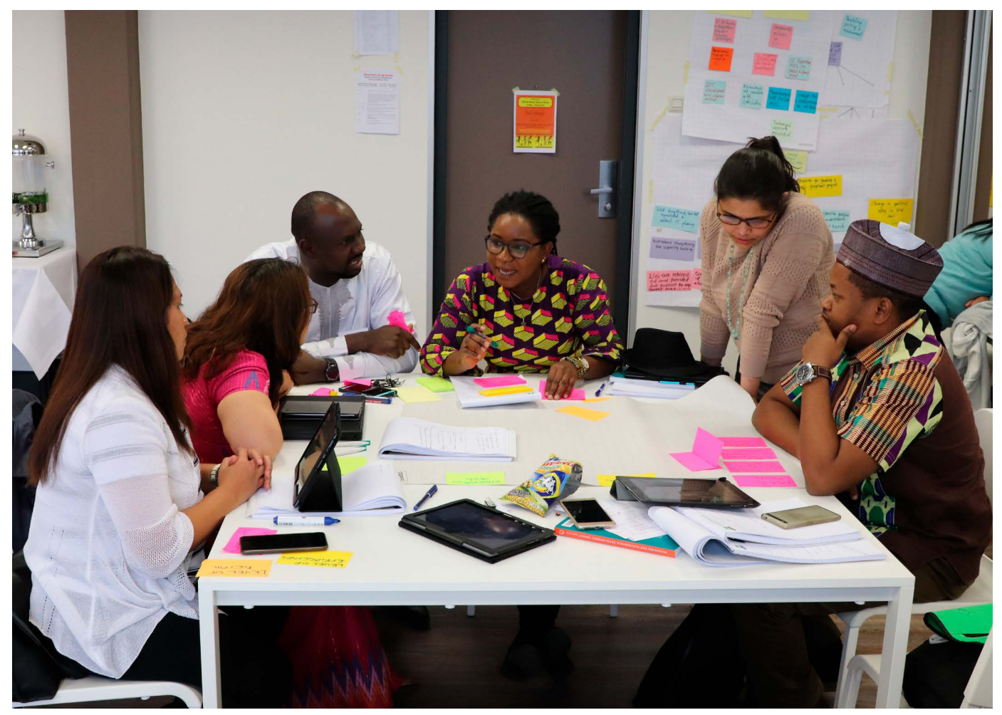
Wageningen Economic Research | Supporting paper 2