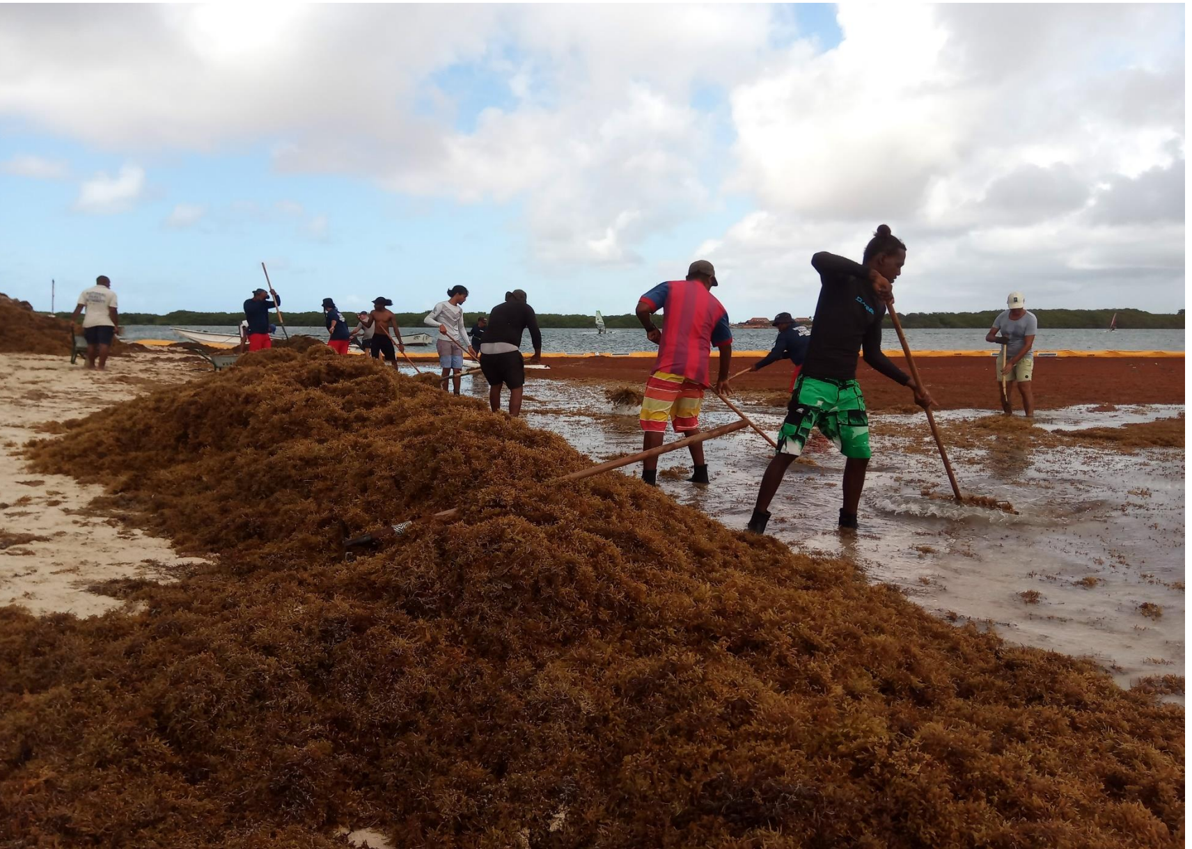
Figure 2. Cleaning of Sargassum on sand in Bonaire.