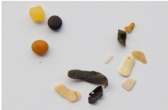
An \pm average stomach content