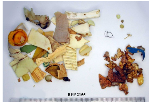
An extreme stomach content