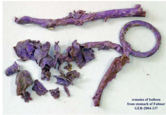
Balloon remains from a fulmar stomach