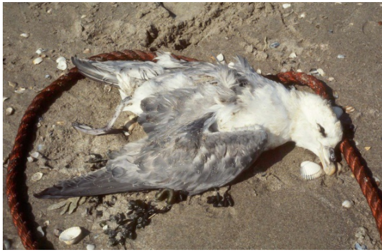
Dead Northern Fulmar on the beach.