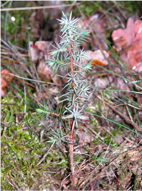
three year old sapling, Loenen, Veluwe