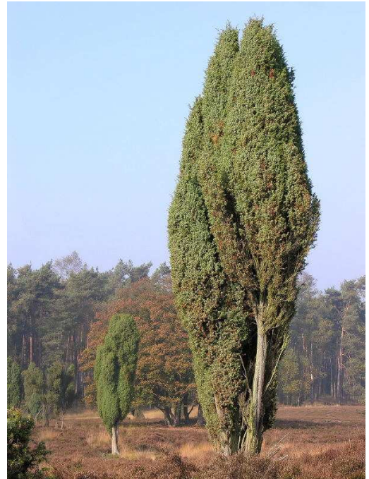
old tree showing fastigate habitus, Loenen, Veluwe.