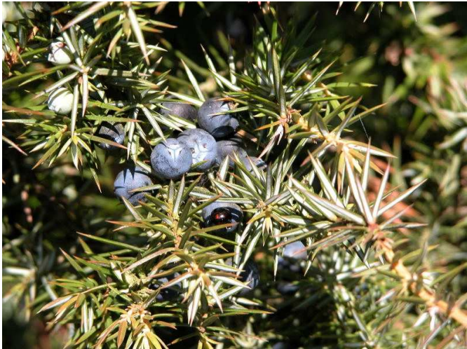
cone-berries and leaves