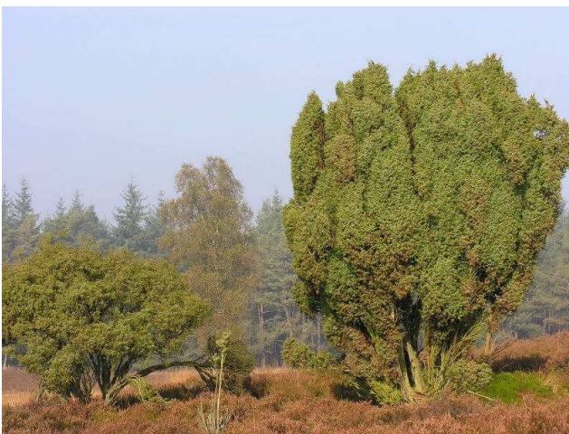
old trees showing other habitus types, Loenen, Veluwe