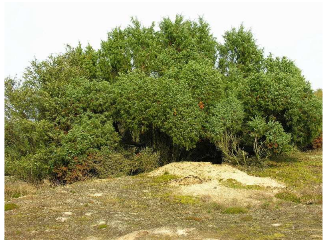
and at Mantingerzand, Drenthe