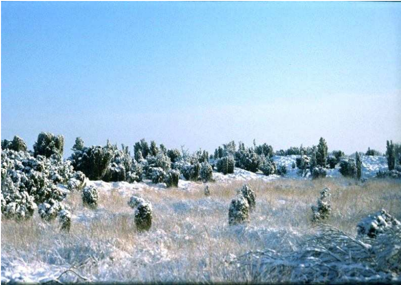
Juniper scrub in Mantingerzand, Drenthe