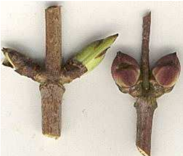
buds in winter