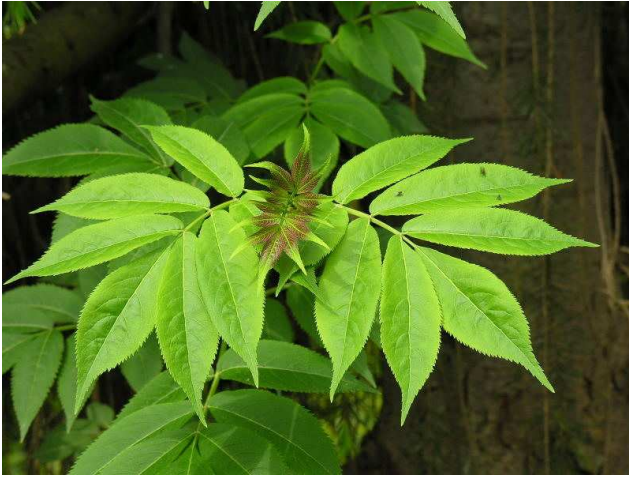
leaves of Red Elder