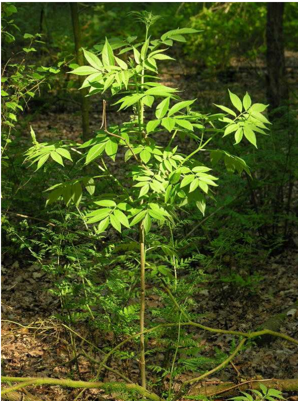
sapling in forest understory. Oostereng, Wageningen