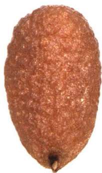
seed: kernel from a Red Elder fruit