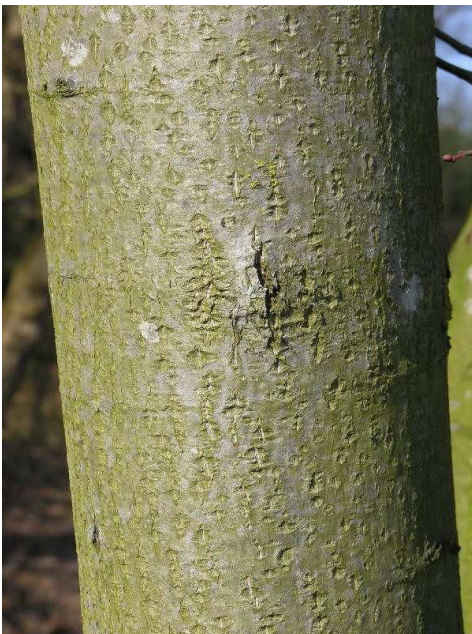
bark of a young tree