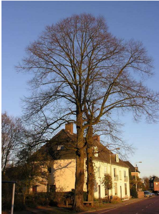
winter silhouette, Oosterbeek