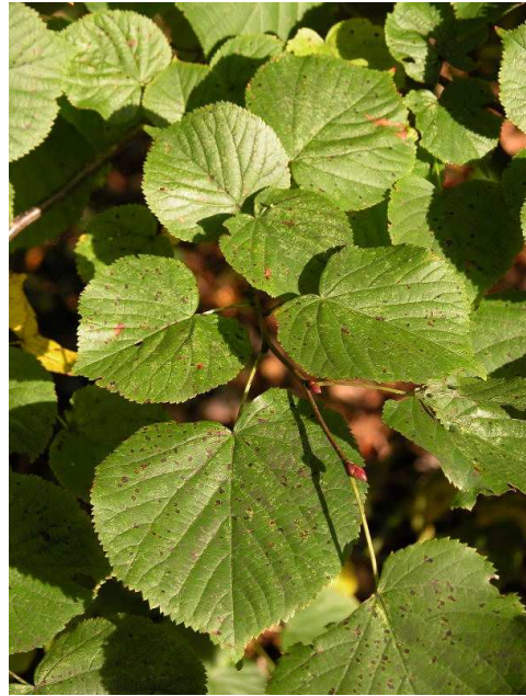
leaves at a branch