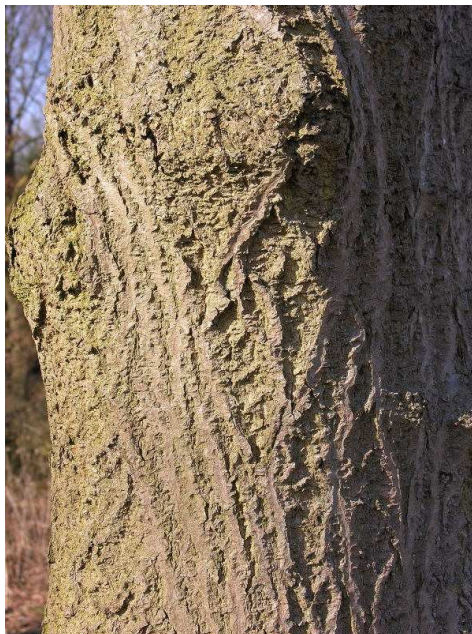
bark of a mature tree