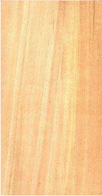
lime wood