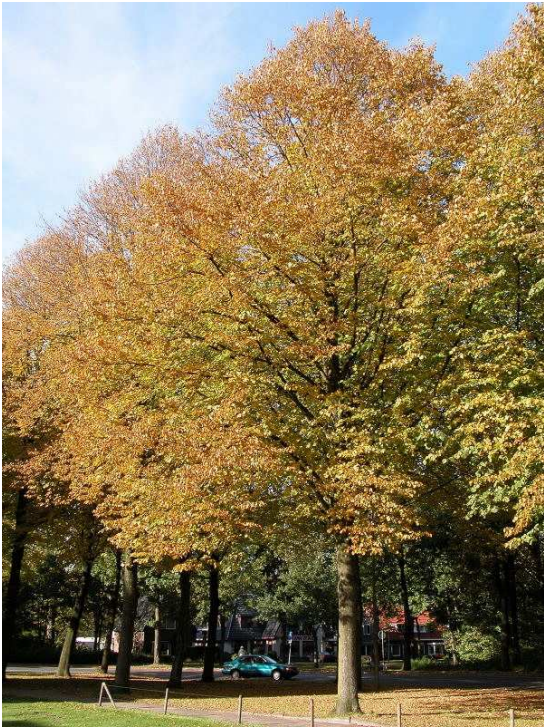
Common lime tree, Wageningen