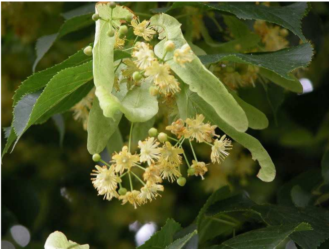
Common linden inflorescence