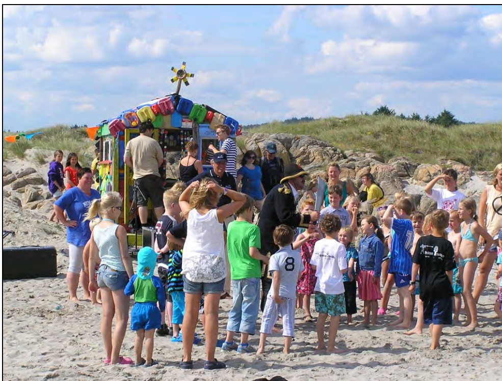
The Ocean Hope exhibition was opened for public at Havika shore afternoon July 5th.

First part of the arrangement was entertainment for the children. Nearly 100 children first participated in picking up litter along the shore and then they finally were searching, together with pirat "King Torius", for a treasure-chest filled up with golden coins (chocolate) hid into the sand..