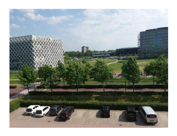
Wageningen Campus 2017 (below) / 2019 (above)