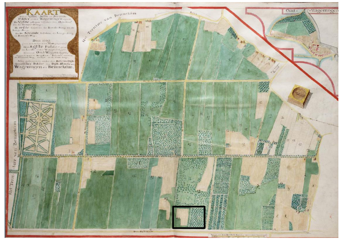
Figure 1 : This map from 1752 of the Bovendijkgraafse polders shows who had a lease on what land and for what purpose. From bottom to top: Dijkgraaf, fifth polder, Bornsesteeg, sixth polder, de Lange Steeg, seventh polder, Brink. Light yellow parts are fields. Tobacco was the primary crop on the drier parts at the peripheries. Plots on the south side (right-hand side of the map) with larger green dots are orchards. The site of the current Dassenbos (in frame) was used as ' Weij en Bouw Land '' (pasture and agricultural land) (16, northern part) and ' Akkermaal ' (15, southern part). The 'Sterrebos' of Landgoed Nergena is seen on the left of the map.

In the early Middle Ages, the residents joined forces in village communities and set up local authorities to jointly manage the land. They built ramparts along the edges of the Veluwe to protect the fields. Wooded banks, hedges and hedgerows served as fences and for the supply of firewood and food. Around the 12th century, landlords seized the initiative for a systematic and extensive exploitation of the lower-lying land. They made the area around the campus more accessible and tillable by straightening and connecting existing streams and roads (Dijkgraafse and Bennekomse polders). Wooded banks, alders, pollard willows, coppice forests and (wet) hay fields and meadows were planted or laid, as well as stately oak lanes from the Nergena estate to the city of Wageningen (figure 1).