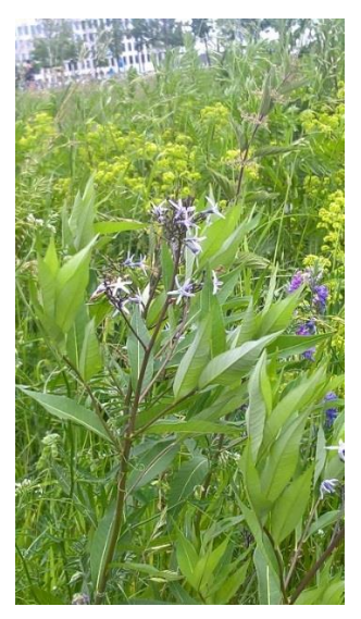
Flower meadow with perennials opposite Orion's terrace. Wild plants mix with exotic grasslands such as pimpernel (Sanguisorbia menziesii) and Iris sibirica (left), European bluestart (Amsonia orientalis) and lady's-mantle (Alchemilla mollis).

In other words, Dutch nature is more than biotic communities of indigenous species. The common corncockle and poppy, for example, are native according to the Dutch Species Register, while the cornflower is an established exotic species. All three are characteristic of the 'grain field' agricultural nature type . The American currant tree is also an exotic species, but is now listed in the Veldgids