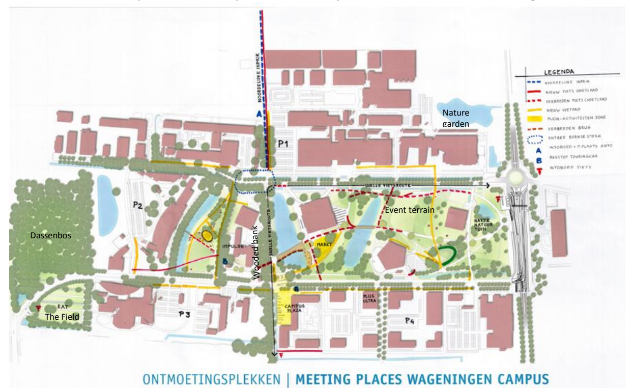
Figure 2 : Layout of Wageningen Campus in March 2015 with new design elements and green spaces (Source: Vibrancy working group for the project 'Further Development of Wageningen Campus').

The municipalities of Wageningen and Ede have published historical value maps. These show that Wageningen Campus consists mainly of wet, locally loamy, sandy soil, traditionally used as grassland. This landscape was more or less regularly divided into ditches, (alder) canals and tree-lined roads. Most of the land had already been drained by the 19th century to be used for fields and buildings.