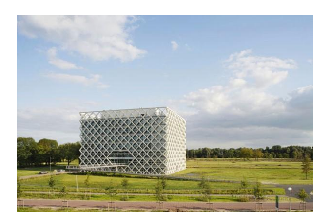
Wageningen Campus 2007

Section 2 formulates a green concept for this purpose and sets out a number of principles for the further elaboration of this concept. This concept is based on the story of the development of the campus' green spaces (section 3) and how they relate to a number of green concepts such as nature, indigenous and exotic ecosystem functions and biodiversity (section 4).