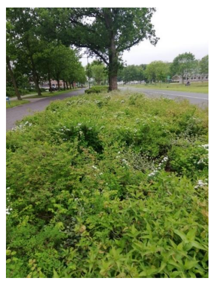
Line of five low-growing ornamental shrubs have something to offer year round and can withstand shade, bright sun, aridity and wet conditions.

The <u>Register of Dutch Species</u> provides an up-to-date and comprehensive overview of plant and animal species naturally occurring in the Netherlands. Dutch specialists bring together the information from other sources and determine the status of a species according to established criteria. For example, whether a species has reached the Netherlands on its own or has been introduced by humans and how it has managed to maintain (and reproduce) itself. This creates a theoretical divide between native and exotic species, whereby the status of a species may change over time. For example, because the ranges of animal and plant species in our part of the world are shifting northwards as a result of changes in temperature. In addition, horticulture in the Netherlands has led to the introduction of species that are slowly but surely seen as an accepted part of our landscape.