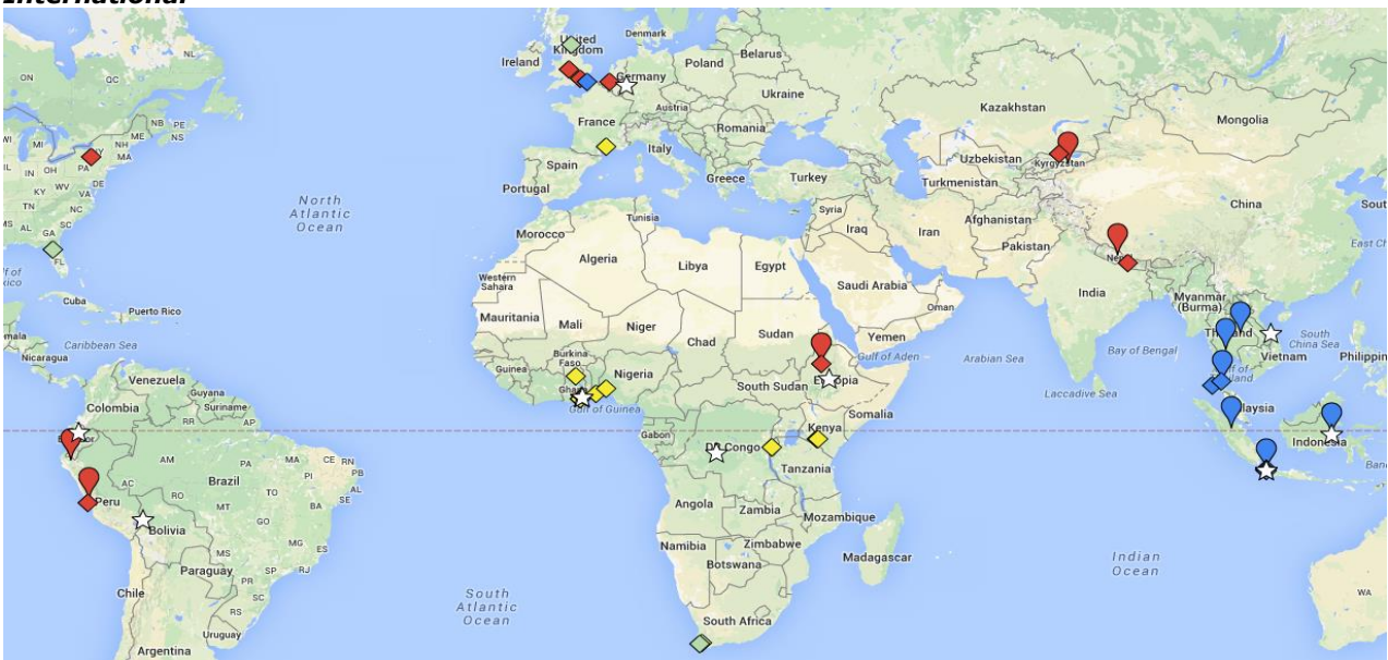
Figure 1.2. International project locations

EVOCA project partner ; Mountain-EVO project partner and case study site; SUSPENSE project partner ; SUSPENSE project partner ; Food System Governance project partner ; International PhD projects